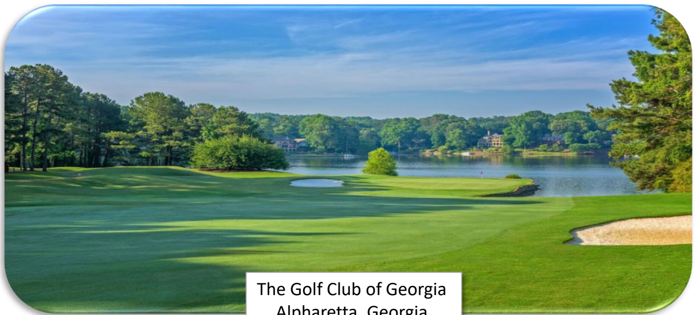
The Golf Club of Georgia Alpharetta, Georgia